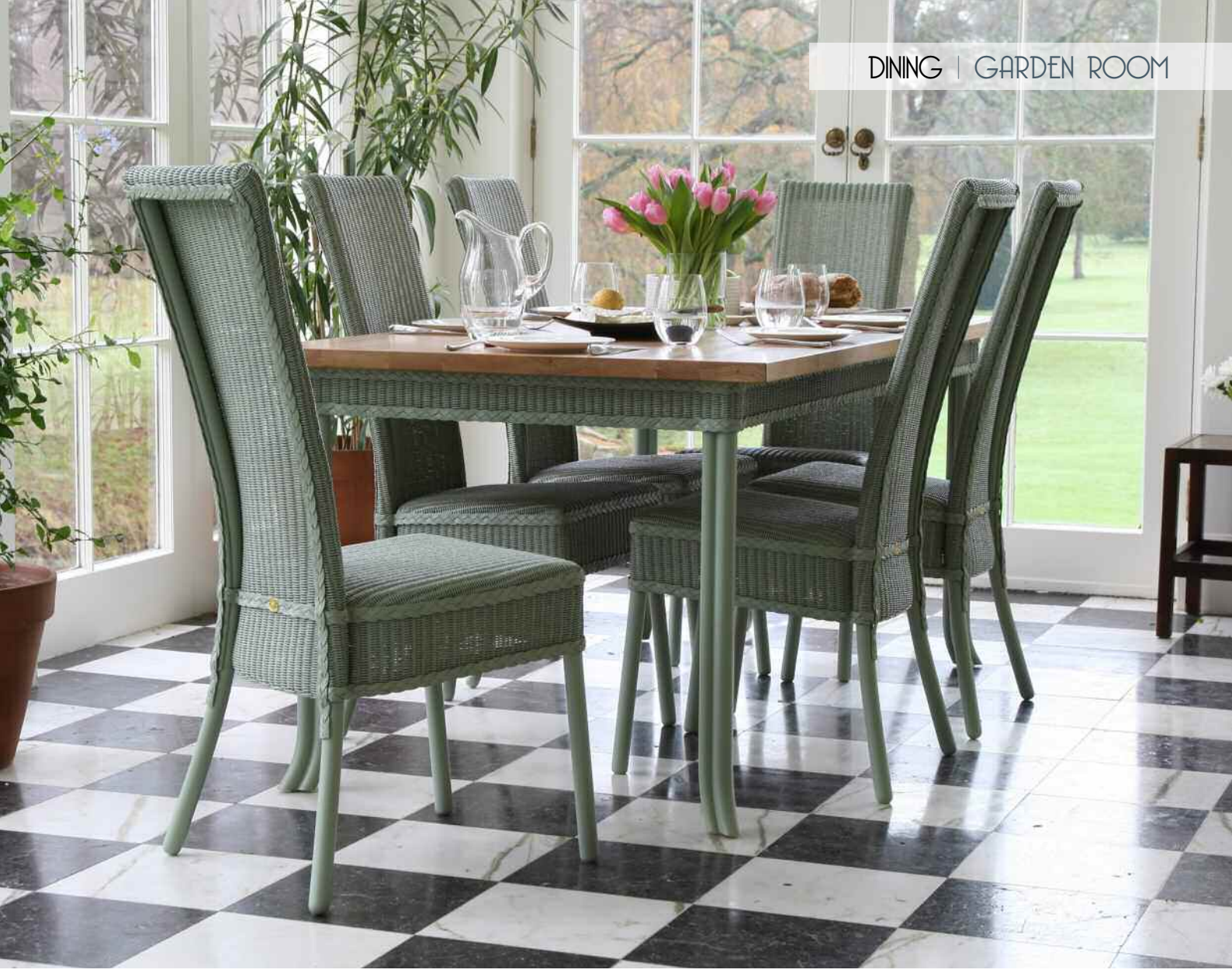
Wells Dining Chairs illustrated in Tarragon weave