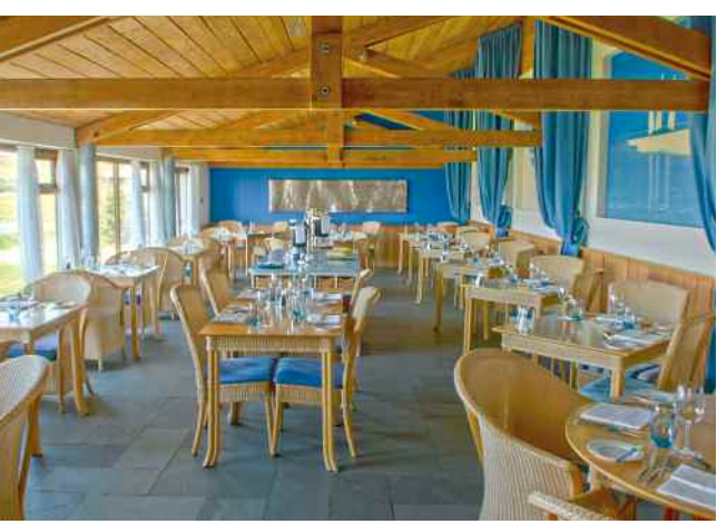
Stamford & Burghley - TRESCO ESTATE