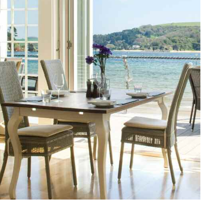
Wells Dining Chairs - SOUTH SANDS HOTEL