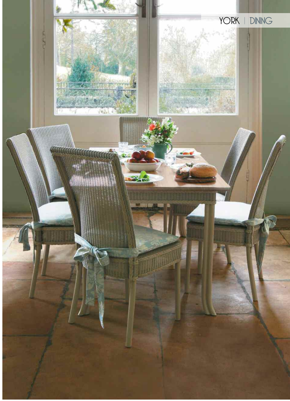
Illustrated in Fawn weave with non-standard cushions in customer's own fabric

YORK DINING CHAIR C037MSPB W480 × D560 × H990 SEAT H475 double weave back