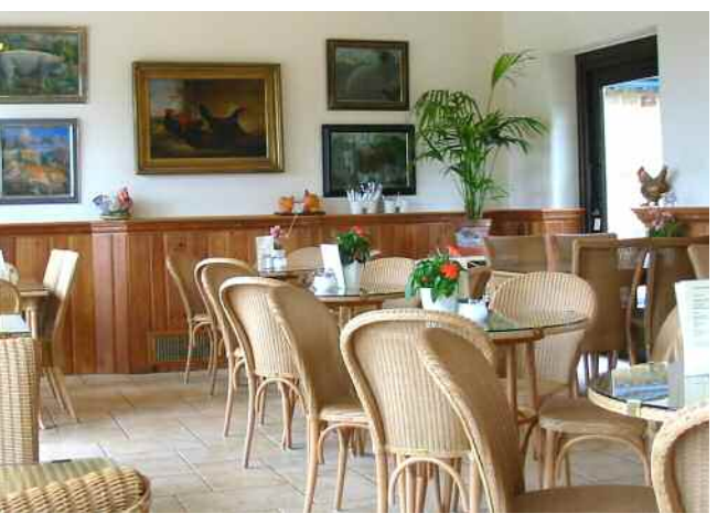
Bistro & Bantam - CHATSWORTH HOUSE