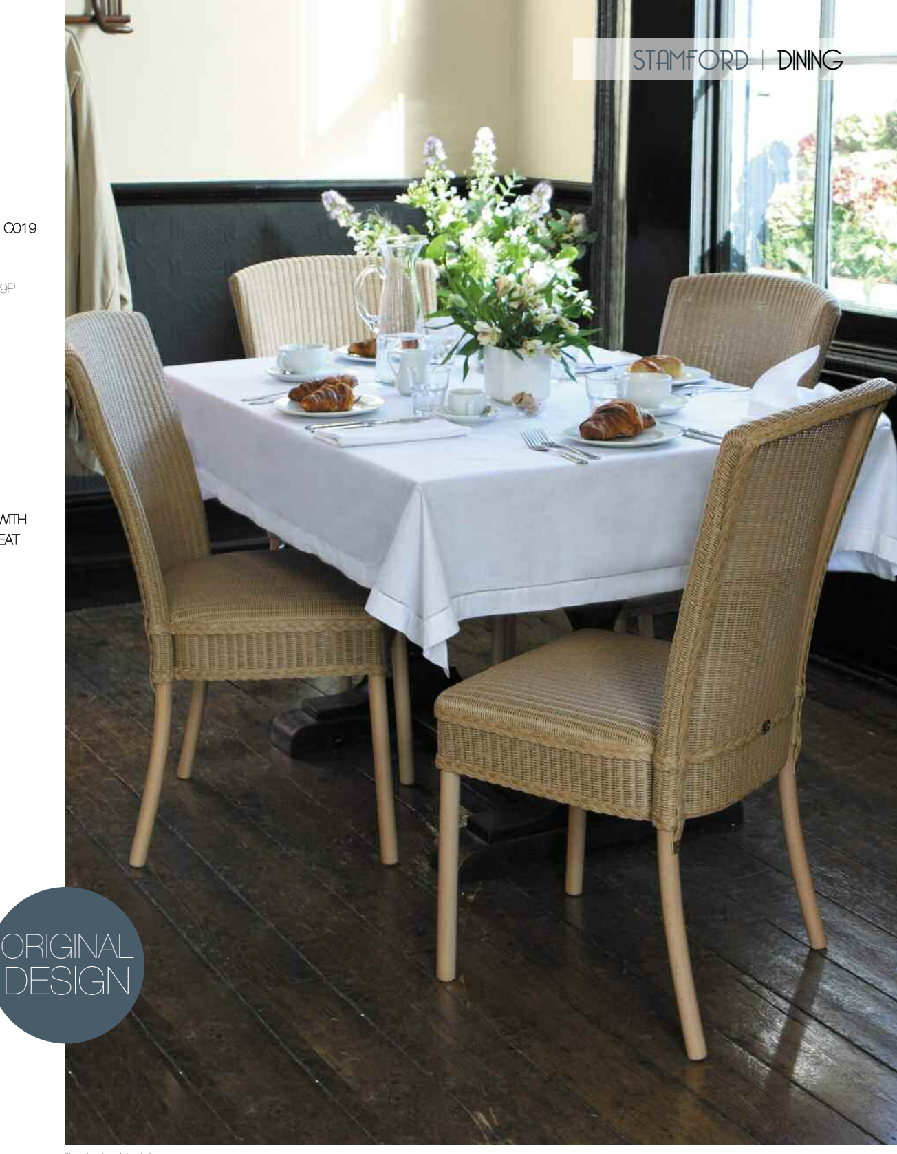
Illustrated in Honey weave