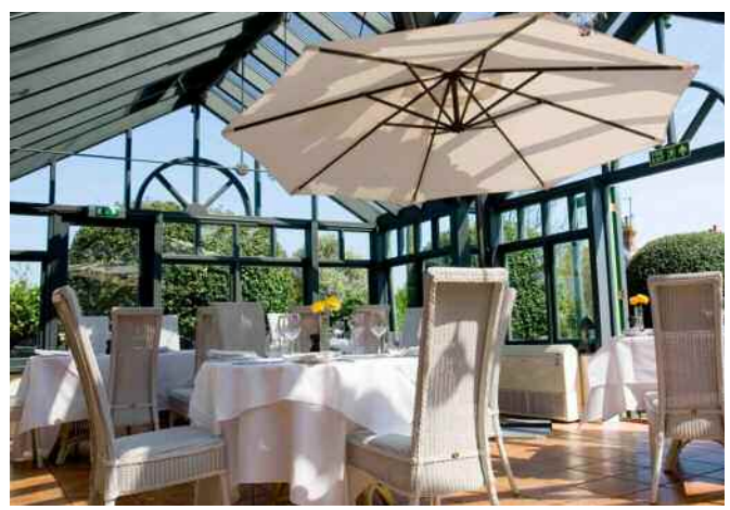
Wells Dining Chairs - TITCHWELL MANOR

Working with Interior Designers, Specifiers and Owners, we can offer advice on product selection and suitability, fabrics and colours, as well as offering space planning services and the possibility of bespoke adjustments, tailor making to a client's requirements.