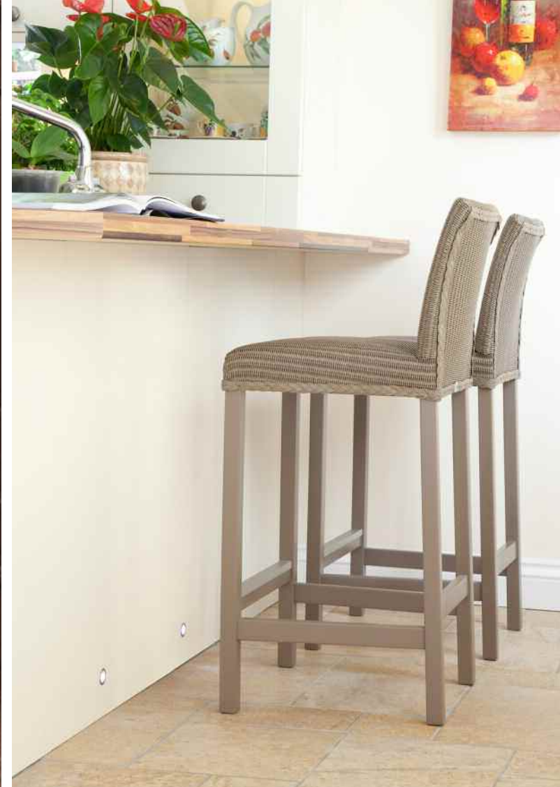
Illustrated in Bracken weave