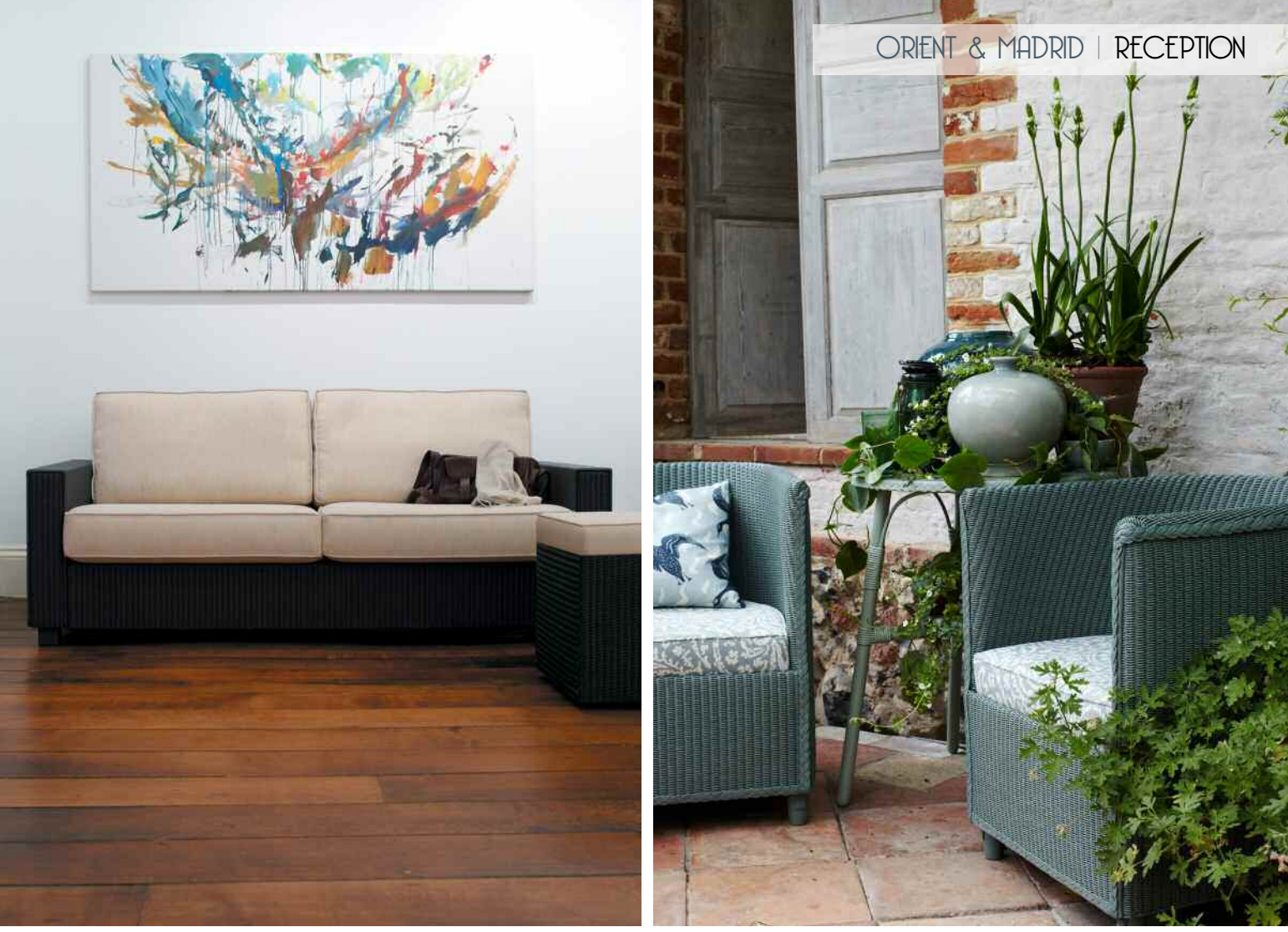
Illustrated in Nearly Black weave