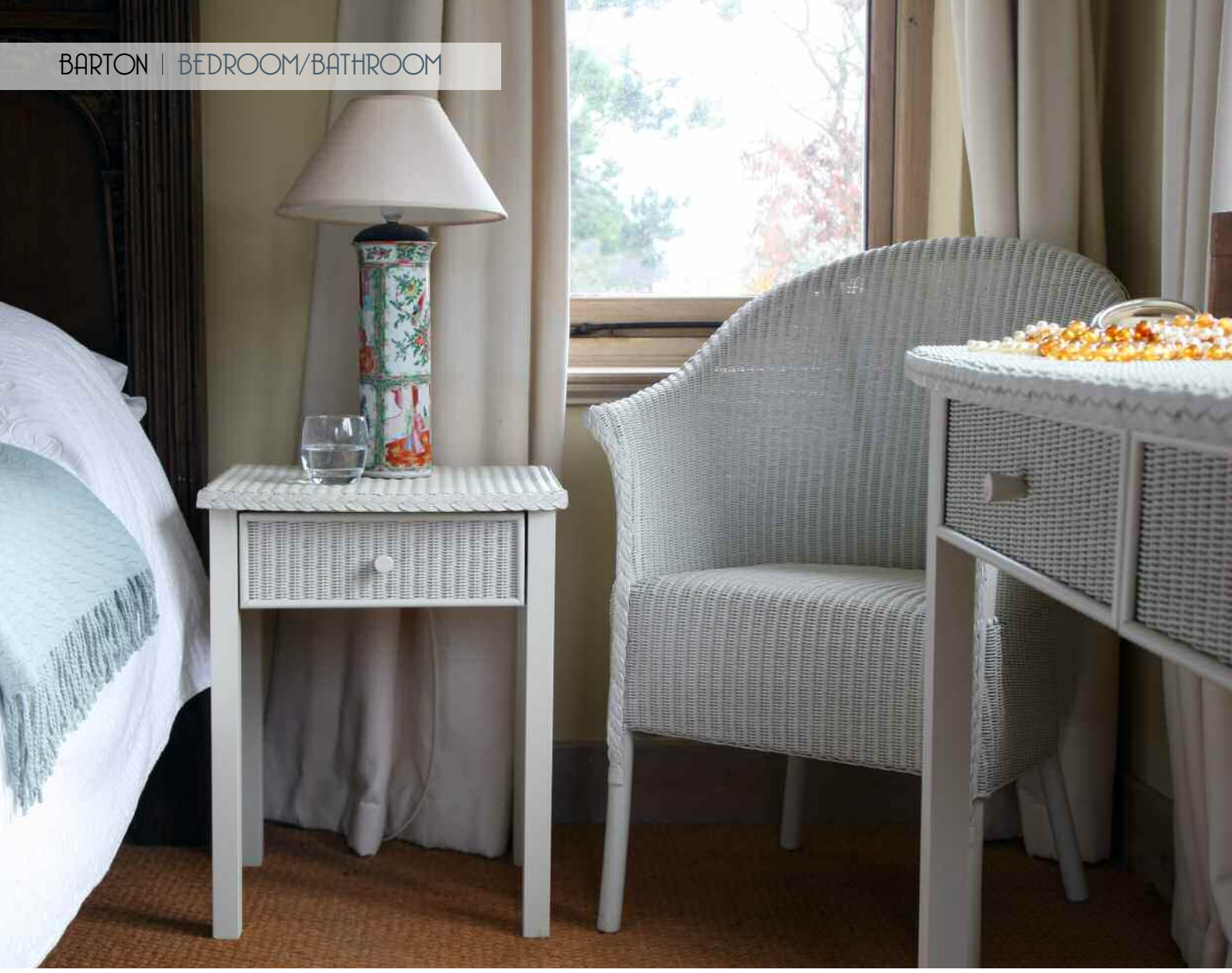
Illustrated in Nearly White weave